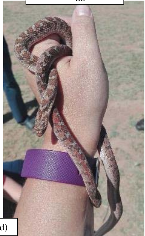
Rhombic Egg Eater