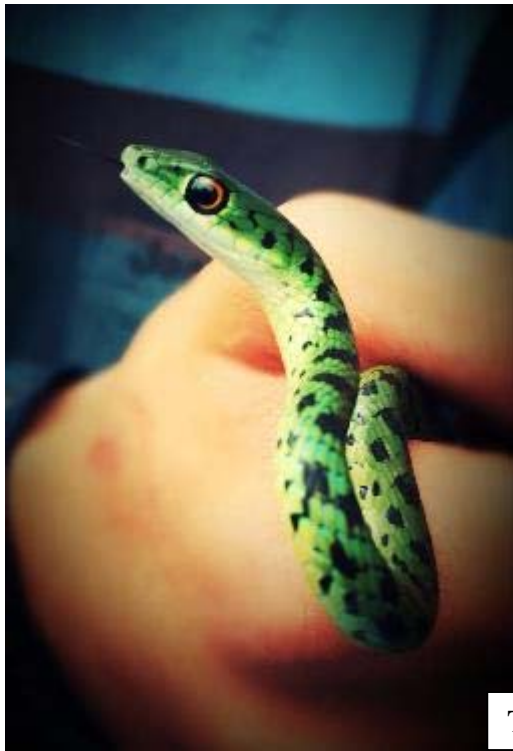
The Spotted Bush snake

"South Africa is home to 171 species of snake. 12 of these have deadly venom, while +/- 50 are considered dangerous but not deadly, with the majority either non-venomous or mildly venomous. Some of the harmless snakes are the Herald snake, the Rhombic Egg Eater and the Spotted Bush snake (often mistaken for a Boomslang). Some of the most common snakes in our area are Puff Adders, Rinkhals, Mfezi, the Spotted Bush snake, the Herald snake, the Rhombic Egg Eater and the Brown House snake. The Egg Eater's teeth are so small, that they cannot pierce skin!"