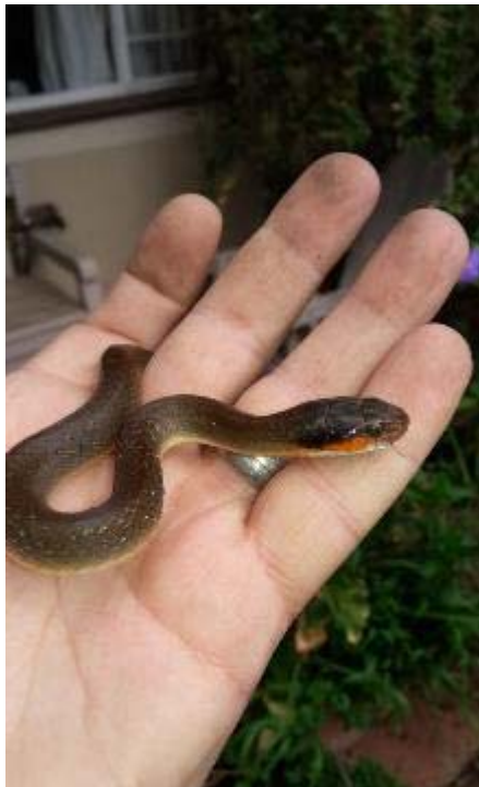
The Herald snake (or Red Lipped herald)