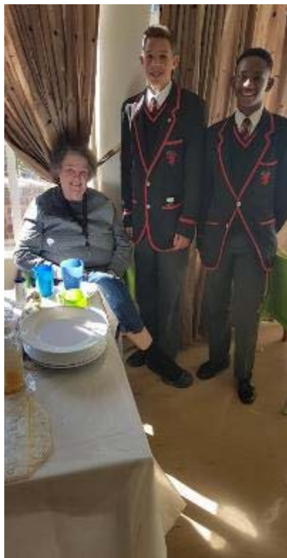
These photographs show our boys visiting Park Care and doing some amazing community work, cheering up the elderly. Well done to you all!